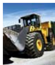
Volvo Construction Equipment