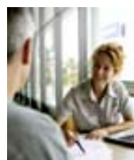
Volvo Financial Services